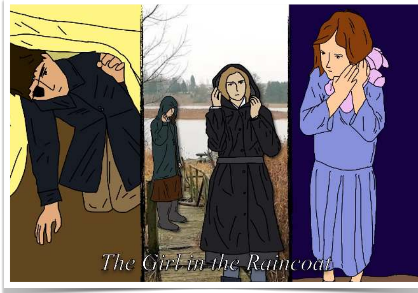
The Girl in the Raincoat